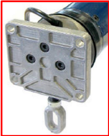
TUBULAR MOTOR Silent Operation